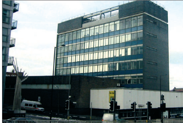
Pride of 1960s

The evening also unearthed a number of interesting memories and stories, including some that