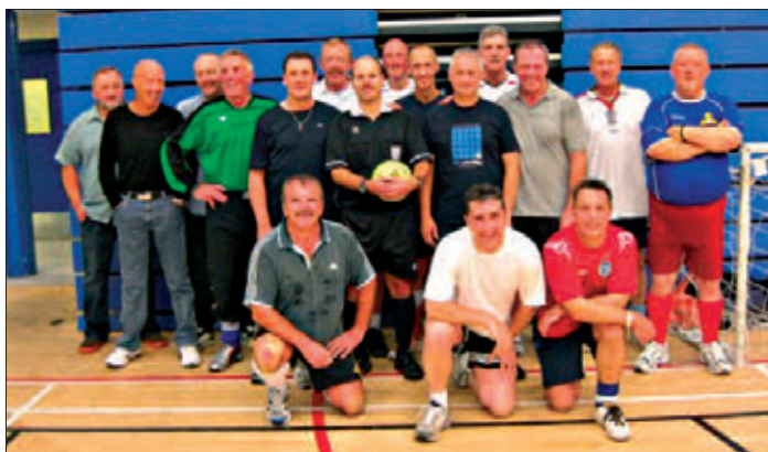
More a game of skill and experience

the seven-a-side football competition which began in the late 1970s.”