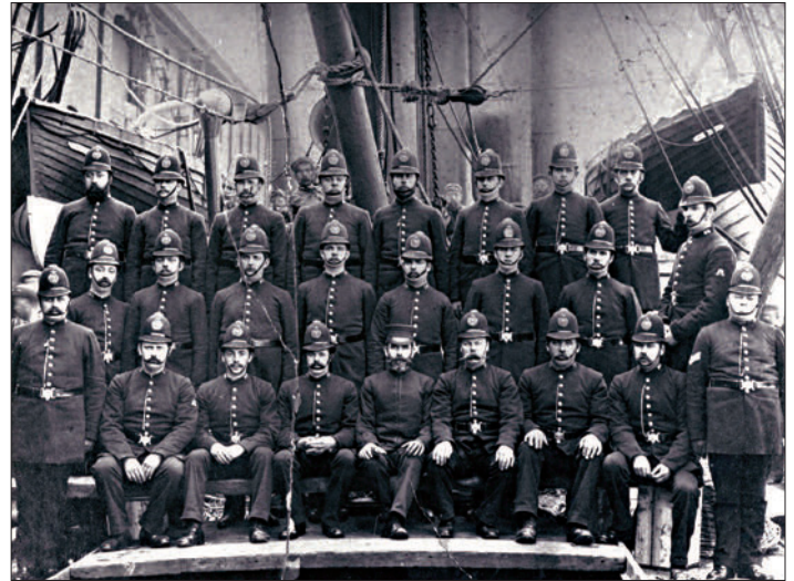
Sheffield Dockers Strike Hull 1893

"I found that the title was a little erroneous and should probably read 'Sheffield Police at Hull Dockers Strike' so after a trawl through the internet, found the information