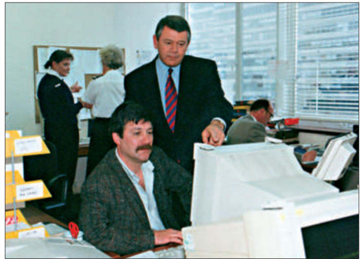
John Duttine later appeared in Heartbeat