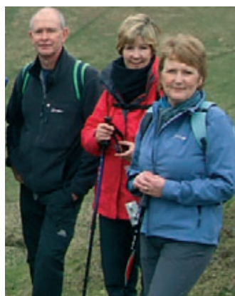
Good walks in excellent countryside

To join the Rambling Ramblers simply get in touch with the