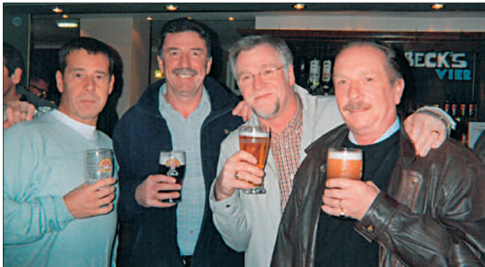
Good beer, good food and good company