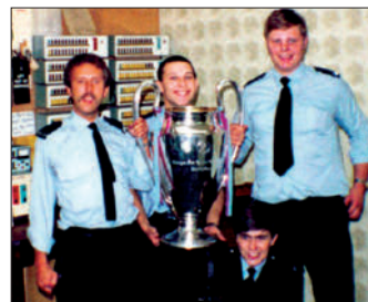
All in a night's duty